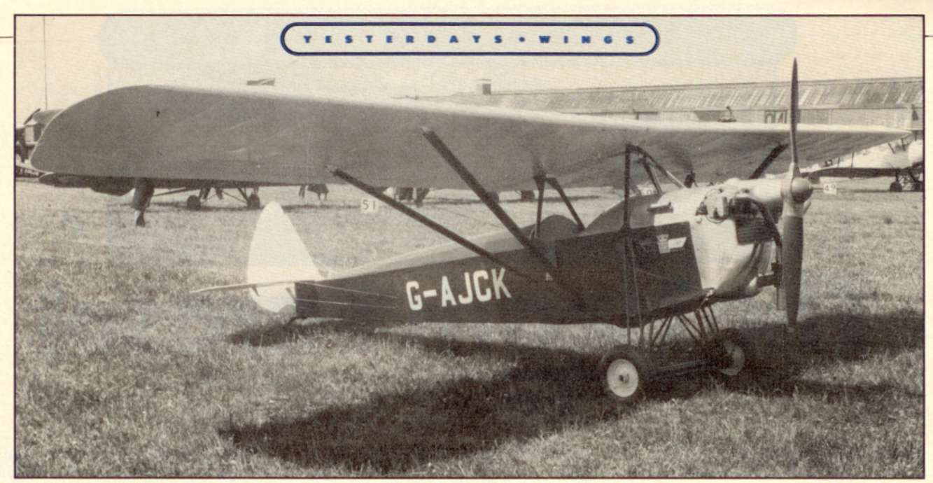
The improved 1930 Super Parasol also was known as the V-Parasol because of its V-struts. Plans for this improved version were serialized in Popular Aviation magazine in 1930. The aircraft shown above was built in England and has modified landing gear and a British-built 36-hp Aeronca E-113 engine. continued and significantly for use in an aircraft. from behind when the pilot was starting it the original engines was commonplace, of

Heath made gradual modifications until there was not much Henderson left other than the crankshaft, cylinders and some moving parts. He enlarged the valves, added finned valve covers for cooling and replaced the rear crankcase cover with a new casting containing a thrust bearing, making that the front end of the engine. He also added a larger and deeper sump. A single Bosch magneto was installed on the right side of the upper crankcase. The bore was 2.75 inches and the stroke was 3.5 inches for a displacement of 83 cubic inches. The compression ratio of the next-to-rear cylinder was decreased from the standard 4.6:1 to offset a tendency to preignition caused by a compression-ratio increase that resulted from carbon build-up in this poorest-cooling-cylinder. The B-4 delivered 27 hp at 2,700 rpm. Though the B-4 never qualified for an engine Approved Type Certificate (ATC), it did win a lesser approval that allowed it to be used in licensed airplanes. Production continued into 1936.